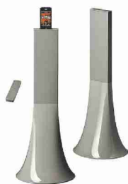
■ Stylish Parrot Zikmu wireless stereo speakers by Philippe Starck, $1,600 per pair at www.parrotshopping.com .