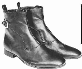
■ Ankle boots, $49.95 at H&M.