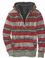
■ Op Men's Sherpa hoodie, $25 at Walmart.