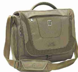
■ T-Tech - Presidio Collection laptop messenger bag by Tumi, $195 at Nordstrom.