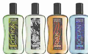
■ Bath & Body Works Signature Collection for Men body wash, $10.50 apiece at Bath & Body Works.