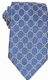
■ Gucci blue and gray silk lattice GG jacquard tie, $144 at www.bluefly.com .