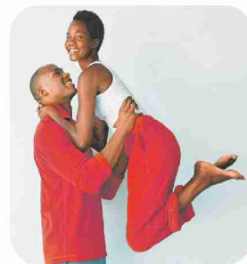
■ Daniel Buchler fleece quarter-zip top with drawstring waist, $39 at Nordstrom.