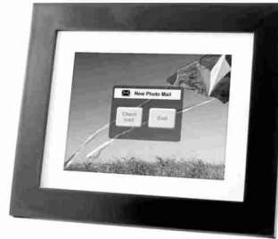
Digital photo frame