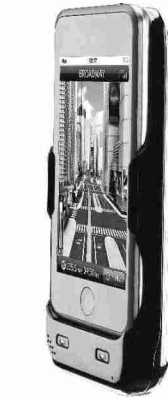
GPS Navigation and Battery Cradle