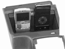
eCoupled wireless power